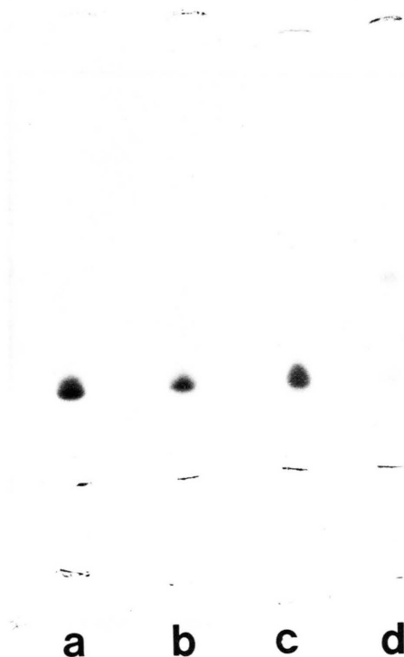
Fig. 2. SDS-disc gel electrophoresis of the 38,000 and 80,000 dalton enzyme species eluted from the Sephadex column of Fig. 1 A. Low-molecular weight form: not cross-linked (a), cross-linked (c); high-molecular form, not cross-linked (b), cross-linked (d). Both, cross-linking with dimethyl suberimidate and SDS electrophoresis were done according to ref. 9

Forms of Fd-NADP + reductases differing in molecular weight were also reported by Fredericks and Gehl [11] in crude spinach extracts. On further purification, which did not include affinity chromatography, the higher molecular-weight forms disintegrated, giving rise to a form of lower molecular weight estimated by gel filtration to be in the range of 50,000 daltons. Analysis of this purified reductase preparation by disc-gel electrophoresis demonstrated several unidentified contaminations as well as — assumed by the authors — two ionic forms of the flavoprotein [11]. Furthermore, by isoelectric focusing, five different ionic forms were found for the spinach reductase by Gozzer et al. [12], which were separated into two molecular-weight classes of 33,000 to 34,000 and 36,000 to 38,000 daltons, respectively (determined by SDS electrophoresis). Similar findings have previously been reported by Keirns and Wang [13]. However, their three different ionic forms of the spinach enzyme exhibited a uniform molecular weight of 37,000 daltons when determined by SDS-gel electrophoresis.